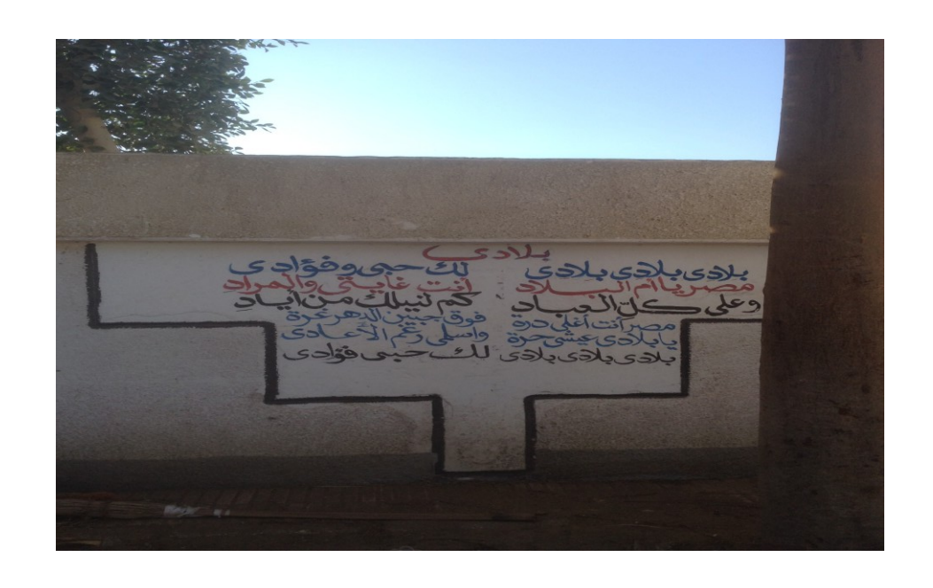
The courtyard of the school