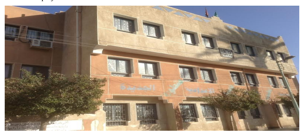
Front view of Al Berka Preparatory school

come from a small group of dedicated community members who have given the time and mental effort to come up with such solutions, was original and dedicative. In addition, CARE had mandated that community members would get involved in all stages of legalizing the lands. Community members had to acquire the approval themselves, sometimes with great difficulties as the local authorities weren't always cooperative or fast. Another fascinating example, which was story-told by interviewed community member 2, was that because they had difficulty collecting money, they would gather the leather that was removed from the slaughtered sheep during the greater Bayrum, and they would take the collected leather material and sell them for money. This money would then get installed into the community's monetary fund for the project. Needless to say, a major barrier for a few villages other than Al Berka, in specific 3, was that they had no land to give in for the construction of the schools; no State owned lands nor private owned lands. However, they had severe educational needs, and people were willing to receive assistance. In addition, citizens of the 3 villages were too poor to give donations in order to buy land. With the coordination of CARE, the governorate had bought the lands for these villages 3 villages, and these were the only example of land contributions provided by the government towards the project.