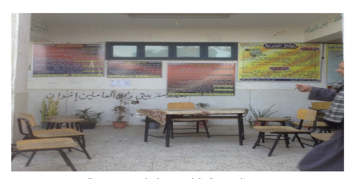
Entrance towards classes and the Principal's room